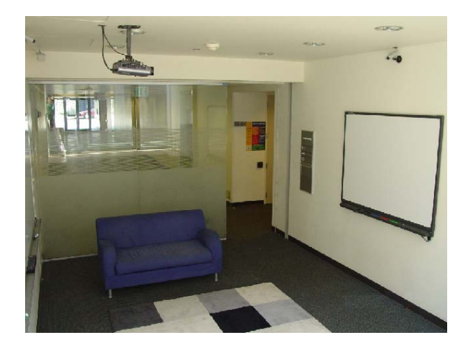
Fig. 1. Smart room testbed

The smart room is representative of typical ubicomp environments and serves as a good testbed for our privacy principles. According to Lessig, the "most serious violations of privacy by anyone's standard" are in the workplace due to email and web monitoring. Physical workplaces involve a mixture of individual and collaborative work. As those spaces are fitted out with sensing and recording devices, workplace monitoring is likely to extend to the physical world. To us therefore, smart workplaces are an excellent candidate for the most serious future privacy violations in ubicomp. The images and log data represent the dynamically generated user data that we seek to protect. We will provide a simple playback application that explores the privacy protections. Figure 1 shows a photo of the smart room testbed. Section 6 will give more details about the prototype system and the experiments we conducted on the smart room testbed.