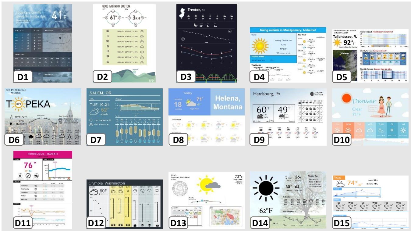
Figure 2. All 15 designs used in the experiment.

value on each platform, the study pragmatically compares the two platforms as designers would use them in the wild.