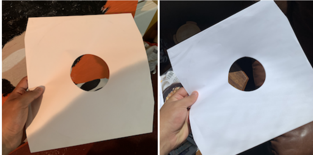
Figure 2: The same piece of paper in the basement and by the window

Submit the two images with names im1.jpg and im2.jpg , both cropped and scaled to 256 \times 256 . Under the same folder, also submit a file info.txt that contains two lines: Line 1 contains four integers x1, y1, x2, y2 where we will take a 32 \times 32 patch around the coordinate on each image and compare colors. (You can use plt.imshow() and plt.show() to bring up a window where you can select pixel with coordinates.) Line 2 is a description of the lighting conditions that you choose. An example of this file is provided for you in the folder. (10 pts)