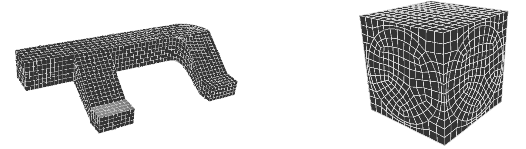
Figure 4. Examples of all-hex meshes generated automatically be the Geode algorithm.

Here again it was necessary to turn off Plastering to generate a fully valid mesh. With Plastering, one of the 11.5k hex elements generated had a negative Jacobian.