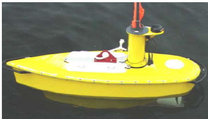
Figure 2. NUWC Station keeping buoy.

Deployment of multiple un-tethered self-positioning vessels in conjunction with traditional moored buoys may offer another potentially useful operational scenario. Moored buoys offer certain advantages over their un-tethered counterparts, including: the ability to ride out rough weather with minimal expended energy, larger power storage capacity, reliable communications to and from land-based stations, and the elimination of sophisticated navigation and control software. These advantages weigh in against drawbacks including: fabrication and maintenance costs, deployment costs, limited effective sensor range, and the potential for entanglement and/or loss due to weather and collisions. However, let us consider a hybrid approach whereby we deploy a single moored buoy which can dock with multiple low-cost highly mobile vehicles with position-keeping capabilities. The docking buoy could provide adequate power for recharging the mobile assets, act as a relay station with increased power for increased wireless range, and permit the potentially more vulnerable mobile assets to dock and maintain position during inclement weather without expending significant energy.