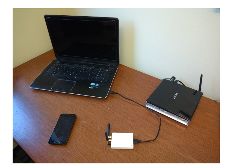
Figure 2: Our Demonstration Testbed