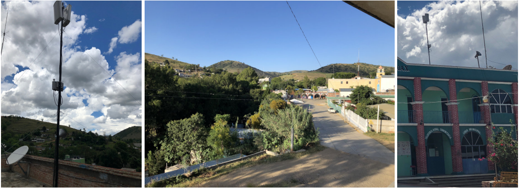
Fig. 1. From left to right: the trial LTE hardware, the view of the centro in Santa Inés, and the town hall and community telecom office.