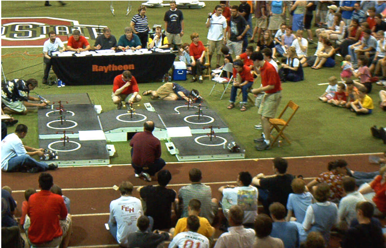
Figure 1. The 2002 FEH Robot Competition.

Large projector screens are utilized along with video cameras and a specially designed software package for displaying the teams participating during each match. Individuals from industry judge the event and determine each robot's score. Winners of each match are then placed against fiercer opponents until finally a grand champion is announced. Prizes, which are provided by industry sponsors, for the winners and other awards such as "Best Engineered" are handed out by the judges during the closing ceremony. A photograph of the 2002 FEH Robot Competition showing one of the multi-level apple orchard test courses described earlier in Section 3.1 is shown in Figure 1 below.