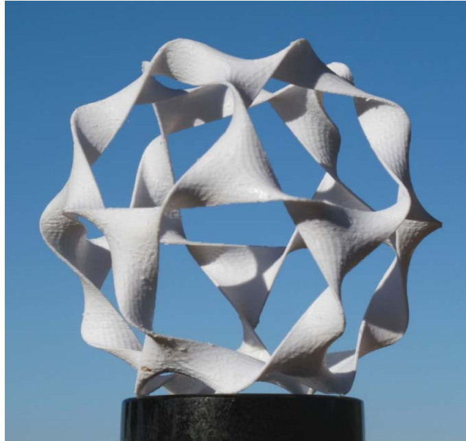
Single-sided soap film filling in the triangular facets.