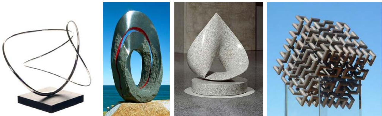
Figure 1: Sculptures based on the unknot: (a) José de Rivera, (b) Keizo Ushio, (c) Max Bill (d) Carlo Séquin.

Once we have closed a strand into a knotted loop, we can deform and squash this knot as much as we want, but its knot type cannot be changed without breaking and re-closing the strand. Thus if we start with a closed-loop rubber band, we can further warp and twist and knot this loop – it will always still be the unknot!