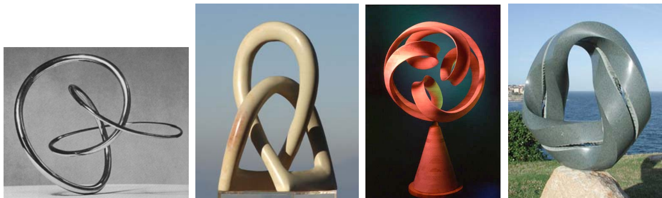
Figure 2: Trefoil sculptures by: (a) José de Rivera, (b) anonym. Kenya, (c) Brent Collins, (d) Keizo Ushio.

The simplest true knot is the trefoil, and this one also shows up in de Rivera’s sculptures (Fig.2a). A different realization of a trefoil in soap stone comes from Kenya, Africa (Fig.2b). Brent Collins has created a trefoil knot with a looping crescent-shaped ribbon (Fig.2c), and Keizo Ushio created one by splitting a triply twisted Moebius band (Fig.2d).