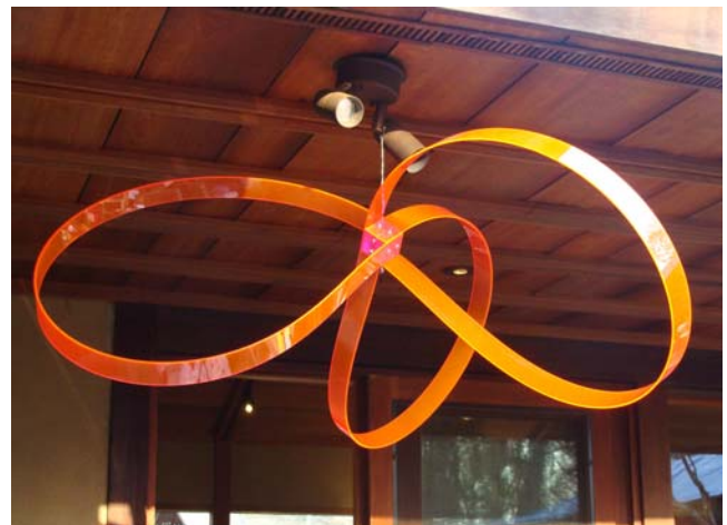
Color Plate 3: Construction of the Trefoil Flower.