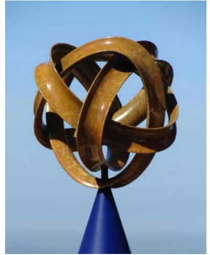
Color Plate 1: (a) Figure-8 Knot , (b) Knot 5 2 , (c) Chinese Button Knot .