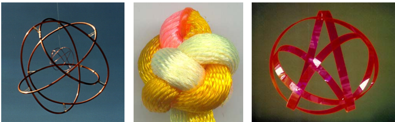
Figure 6: Knot 9_{40} showing spherical symmetry: (a) made from copper tubing/wire, (b) as a true button knot, (c) plastic ribbon sculpture.

If we optimize this knot by knot-tightening [2], the structure shown in Figure 5c appears. This tight, button-like configuration has given this knot its name; it is indeed used as a button on some Chinese clothing (Fig.6b). Figure 5d shows the same basic arrangement of the lobes but in a more cubistic style using a square cross section for the strand. Once we examine this knot as a truly 3-dimensional structure, a nice spherical symmetry becomes apparent. It can be drawn nicely on the surface of a sphere with its 9 alternating over/under crossings located at latitudes zero and \pm 60 degrees, and with longitudes 120 degrees apart. Figure 6a depicts this structure in a knot made from copper tubing, with a smaller version inside made from copper wire. Further possibilities arise when the knot curve is swept with a non-circular cross section. A crescent-like cross-section was used in the small bronze sculpture shown in Color Plate 1c. Figure 6c shows an implementation with a flat rectangular cross-section, realized with acrylic plastic strips.