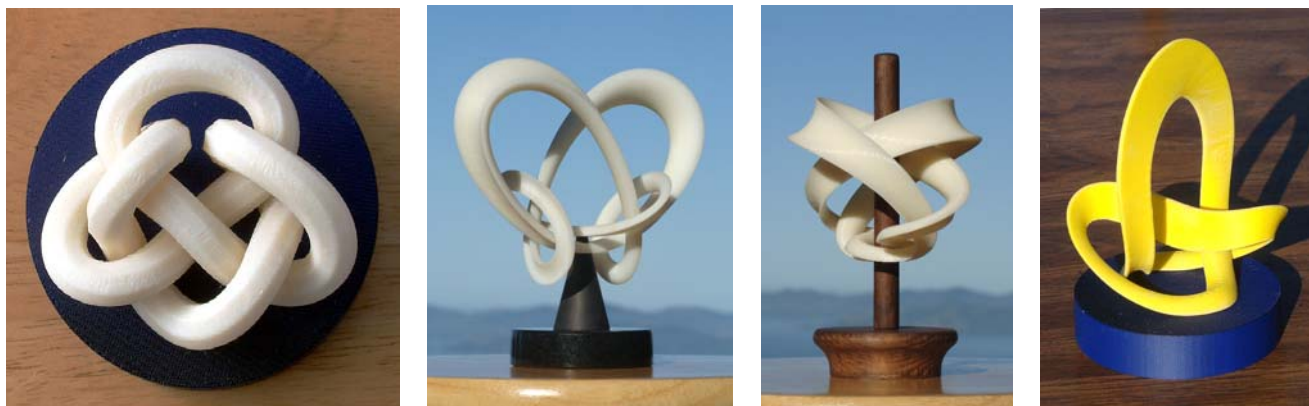
Figure 4: (a) Knot 7_7 by itself, (b) Knot 7_7 as a sculpture, (c) suspension of Knot 6_1 , (d) free-standing Knot 3_1 .

Often the various lobes of a knot are its most prominent aesthetic features, and having them touch the ground may diminish their visual impact. The possibility often exists to suspend a knot from a more central point, possibly lying on the symmetry axis. This approach has been chosen for Knot 5_2 (Color Plate 1b). If the knot is more complicated and thus consists of a much longer strand, having this strand supported at only one point may not be enough. The whole structure may become too “springy” or may even sag. If the ribbon makes a second crossing with the symmetry axis, that point could be used as a secondary suspension point. This technique has been employed in Knot 7_7 (Fig.4b) and in Knot 9_{40} (Color Plate 1c). What if the knot path has no crossings with the symmetry axis at all? Knot 6_1 can be deformed into such a case. The ribbon then just wraps around the symmetry axis. I chose to mount it clinging to a pole like a koala bear (Fig. 4c). Finally I explored whether a knot can “stand on its own feet.” A first example is the trefoil knot from Kenya (Fig.2b). My own version of a trefoil knot standing solidly on two of its lobes is shown in Figure 4d.