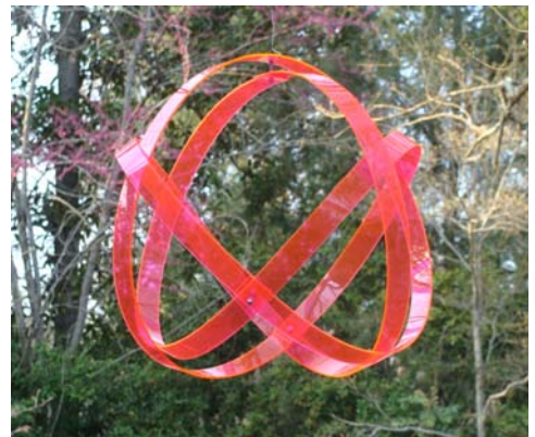
Color Plate 2: Construction of the Chinese Button Knot.