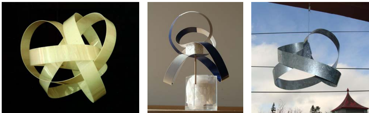
Figure 7: Other ribbon sculptures made from: (a) plastic strips, (b) paper strips, (c) metal bands.

Keeping in line with my plans for talking about the “Beauty of Knots” at the 2010 gathering, I immediately thought of some banded knot representations as presented in Figures 6c and 7a. Since the conference organizers were looking for some self-contained, free-standing out-door sculpture, I thought that such banded knot realizations could be set on some poles and thereby turned into “Knot Flowers” (Fig.7b). Geometrically, this does not pose any big problems, and I readily generated several small scale models made from wooden cubes and paper strips.