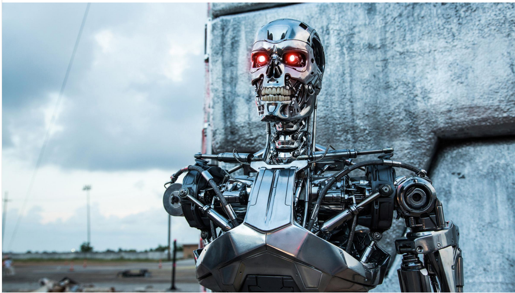
Killing machine A robot in Terminator Genisys (2015)